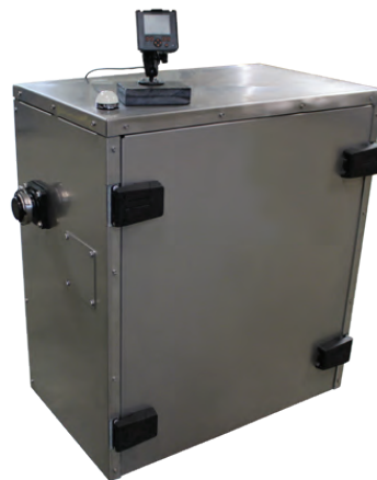
Brine Boss Eco™