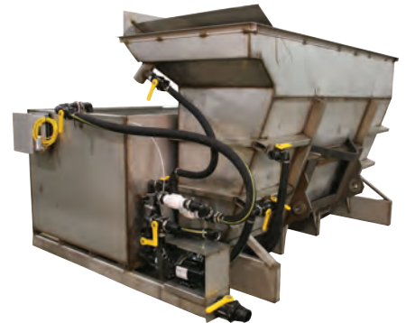
HSCB1400-SS Sold Separately