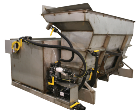
HSCB1400-SS Sold Separately